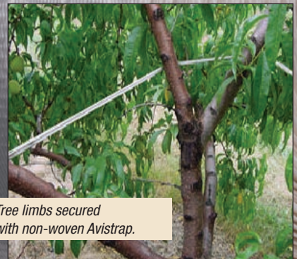
Tree limbs secured with non-woven Avistrap.