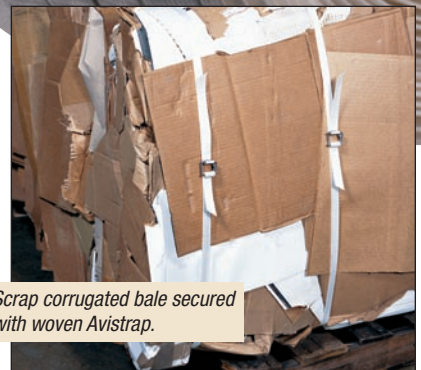
Scrap corrugated bale secured with woven Avistrap.