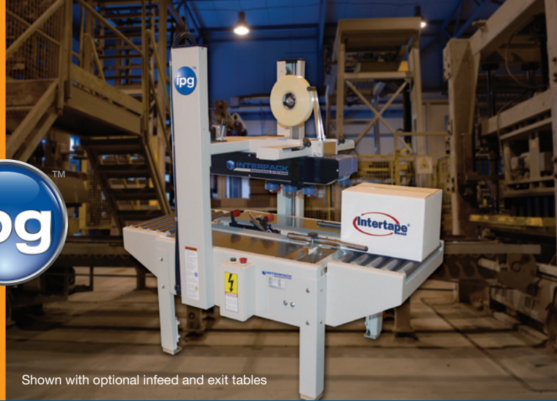
Shown with optional infeed and exit tables