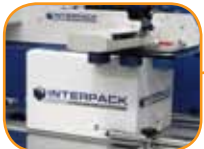
3 wheel top squeezer