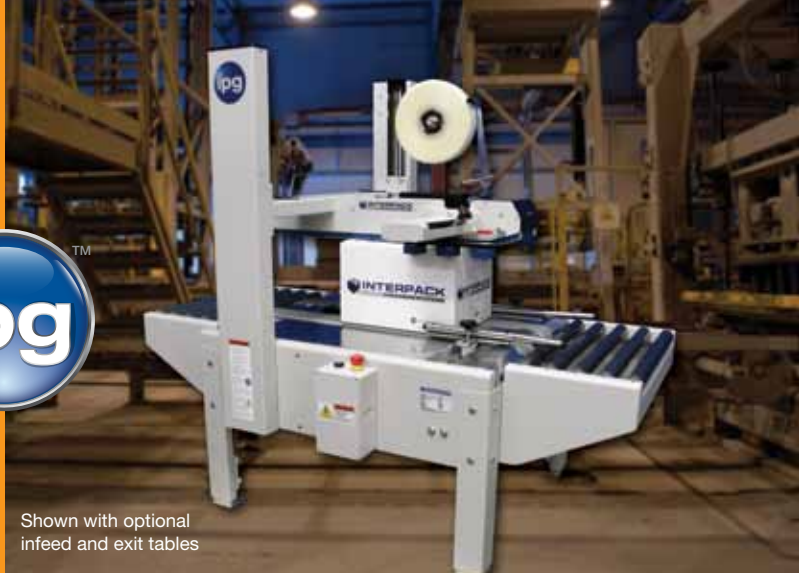
Shown with optional infeed and exit tables