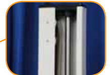
Slide and lock upper head eases case size setup