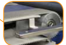
Self-tensioning & self-tracking drive belts simplify belt replacement