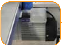
One ½ HP gear motor to process up to 85 lb cases