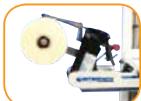
Tip up top tape head eases roll replacement