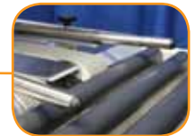
Horizontal self centering guides for simple case size setup