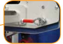
Selectable floating upper head processes compressible overfills