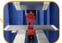
Bottom belt drive processes heavier cases