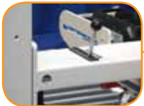
Single handle locks upper head to both columns