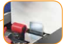
Index gate positions case for proper processing