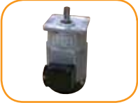
1/3 hp motors for heavy duty usage