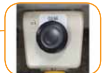
"Clear" button for jams & replacing bottom tape roll