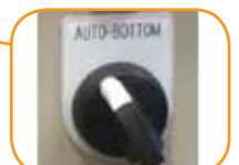
Top & bottom or bottom only seal operation modes