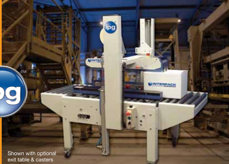
Shown with optional exit table & casters