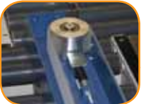
Self-tensioning & tracking side drives simplify belt replacement