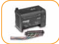
Digital pneumatics to improve throughput speed