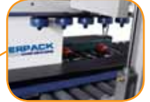
Optional top squeezers compress top major flaps