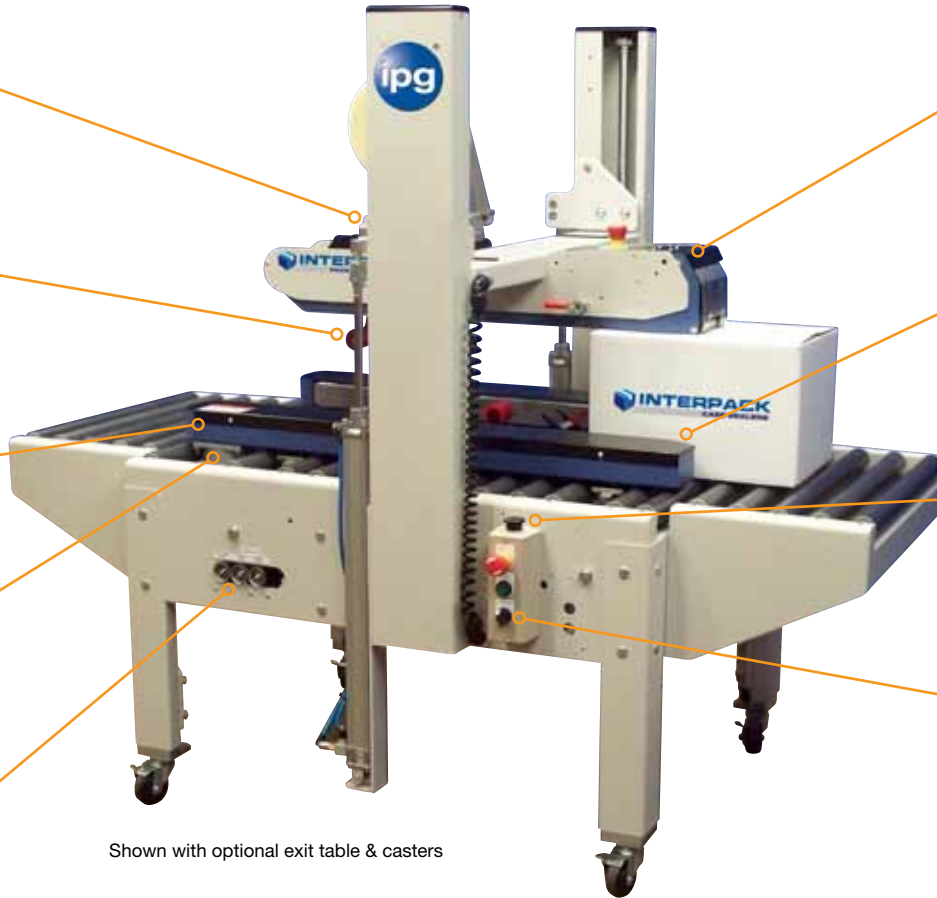
Shown with optional exit table & casters