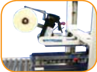
Tip-up tape head simplifies roll replacement