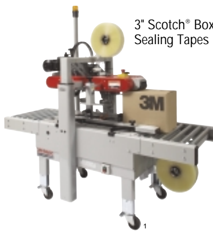
3" Scotch® Box Sealing Tapes