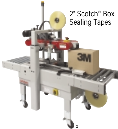
2" Scotch® Box Sealing Tapes