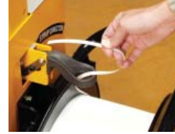
Simple coil change