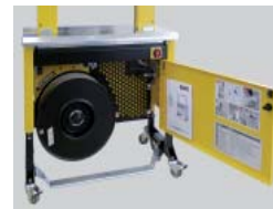
Heavy duty design