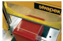
Hold down device for compressing loose packages