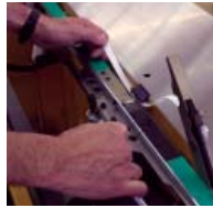
Maintenance without tools