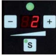
Strap tension easily adjustable with press button