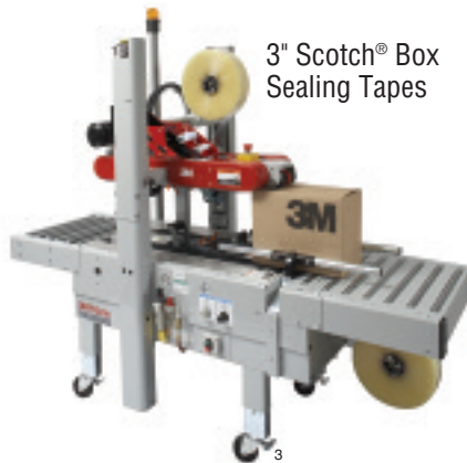
3" Scotch® Box Sealing Tapes