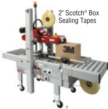
2" Scotch® Box Sealing Tapes