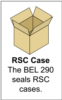
RSC Case The BEL 290 seals RSC cases.

Fully Automatic Case Sealer with Tape Closure Up to 45 cases per minute