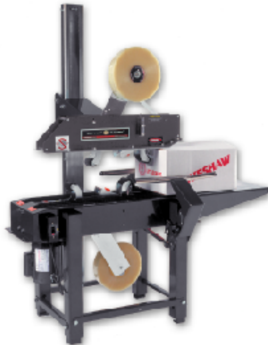
(Shown with optional pack table.)