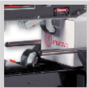
Self-centering side rails

Little David delivers packaging equipment that works for you